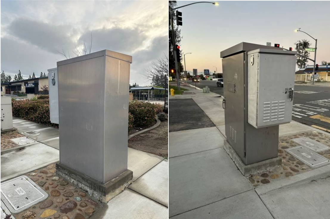
(sample front and back of a utility box)

Artist will be responsible for design elements on all four sides of the utility box including attached exterior cabinets. Below you will find a sample image of a utility box and the design template which is linked on the call for artist page.