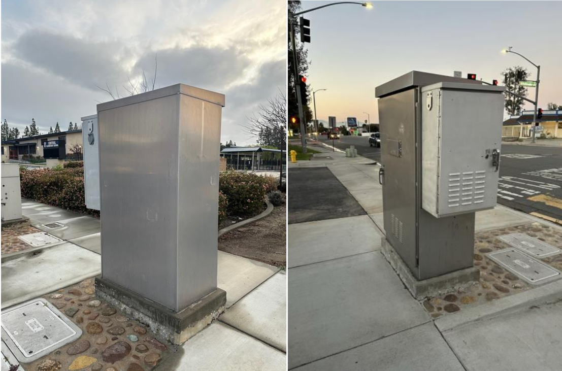
(sample front and back of a utility box)

Artist will be responsible for design elements on all four sides of the utility box including attached exterior cabinets. Below you will find a sample image of a utility box and the design template which is linked on the call for artist page.