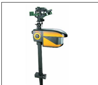
Motion Activated Sprinklers (Scarecrows)