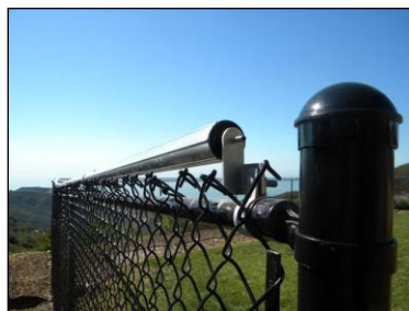
Coyote Rollers Fencing ( http://www.thecoyoteroller.com/ )